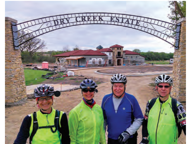
Take a wine tasting break on the route